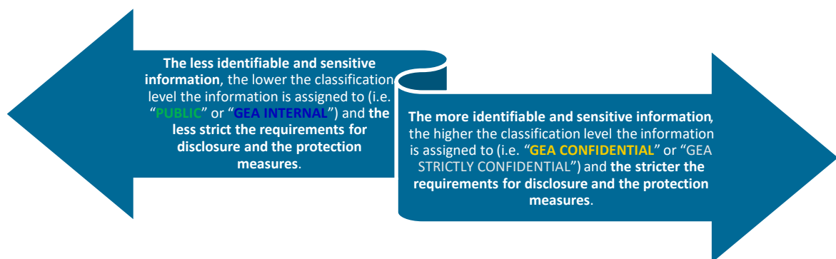
Figure 1: Basic principle for information classification and handling