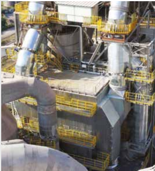
Waste heat exchanger (horizontal gas flow)